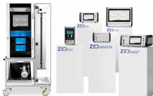
ZEDflex with ZEDcontrol